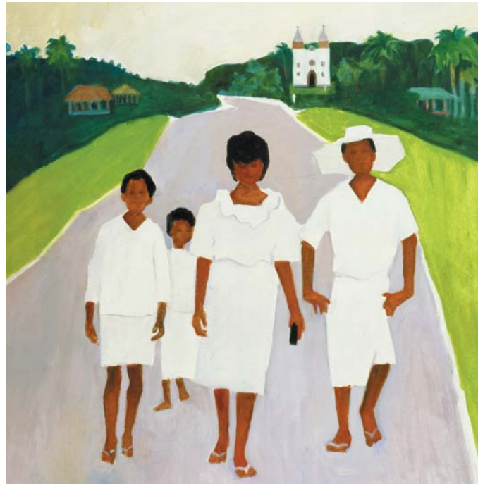
Sunday in Samoa, 1989