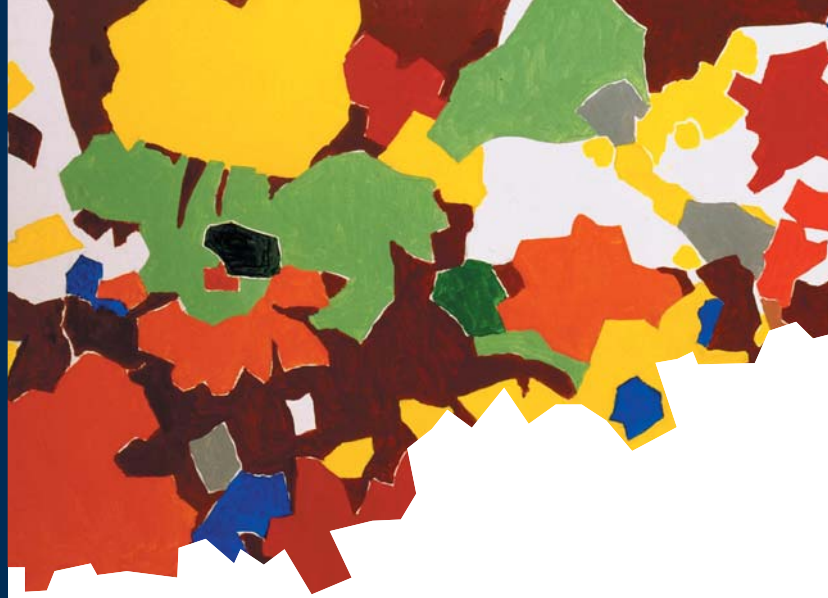
Large Abstract (detail), 2000

His story is interwoven with the socio-cultural history of Queensland, Australia, with formal recognition conferred on him in 1994 with an honorary doctorate.