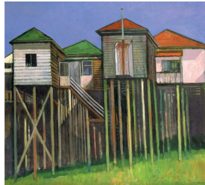
Stilt Houses, Paddington, Brisbane, 1993