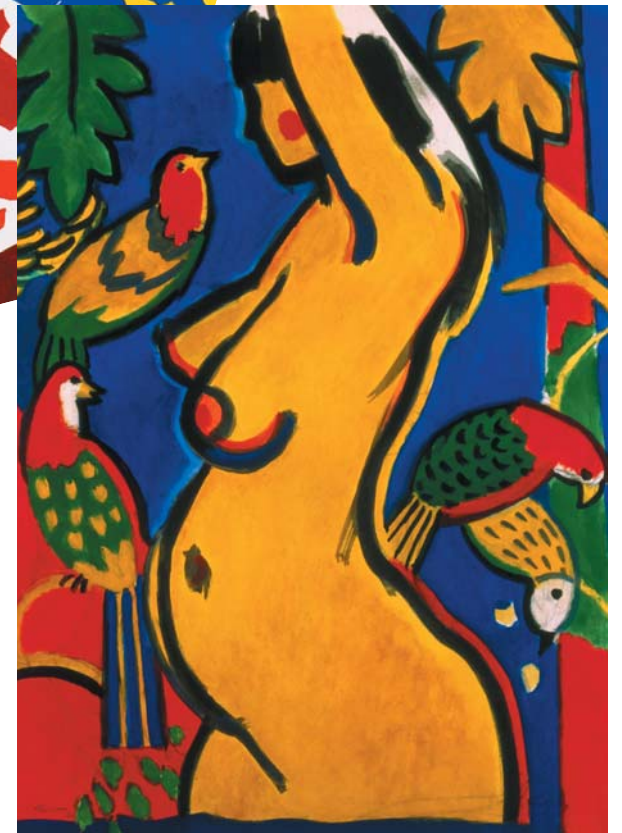
Nude with Parrots (half of diptych), 1991