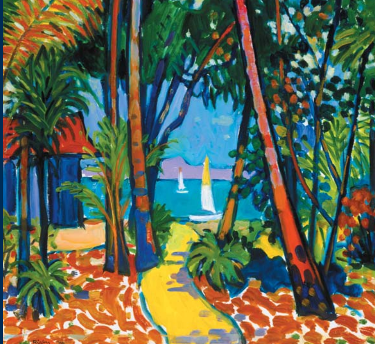
Sunlight and Shadow, Brampton Island, 1996